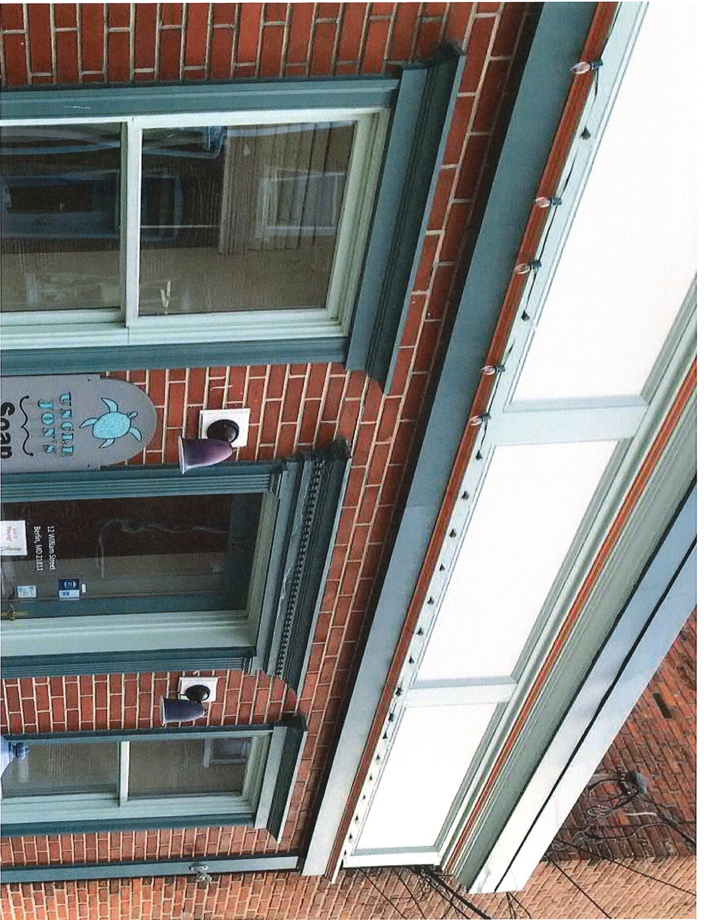
12 William Street